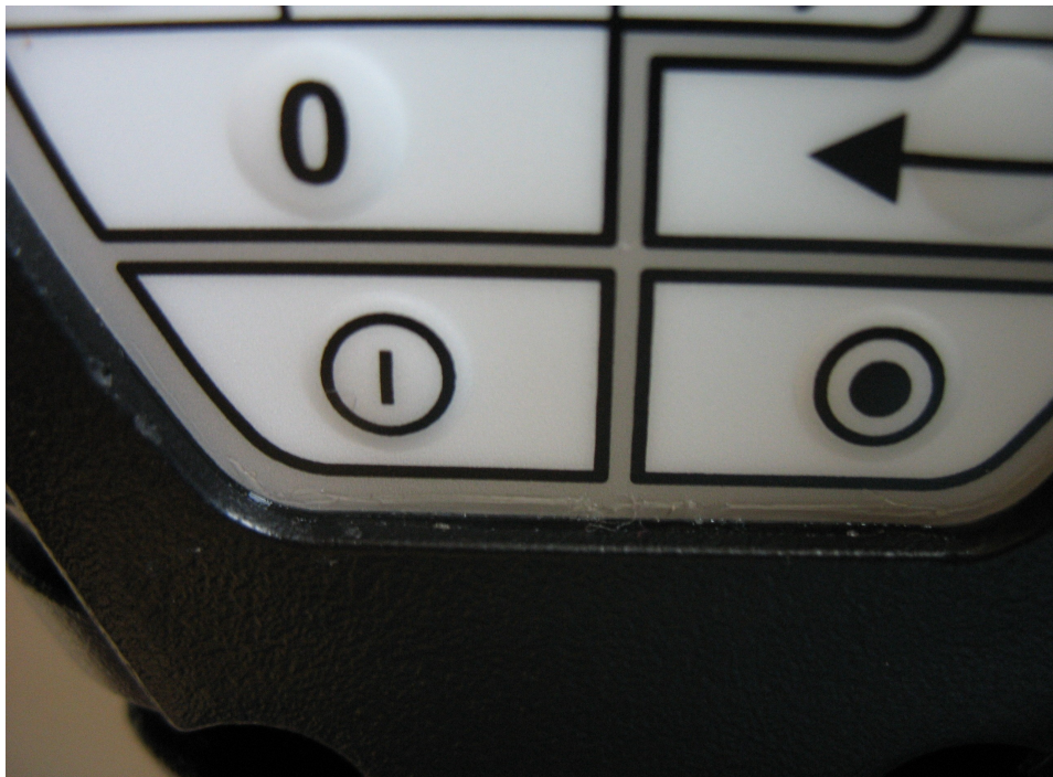
Glue after dry up.

Give a glue at least 24 (48 hours preferable) hours before expose to water.